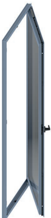
Corrosion class 4